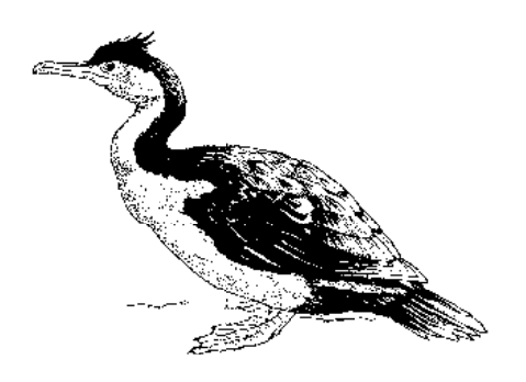
Cast your cares on the Lord and He will sustain you. Psalm 55:22

Now some folks seem to say to God, "You needn't call on me, But if I'm ever in a bind then I'll call You, You see. I'll tell you just what You should do, and how it should be done, I've heard You're good at helping folks when life is no more fun. I know You're busy with Your work so I'll not bother You Unless I'm really in a jam and don't know what to do " It doesn't seem too smart to wait to talk to God, my friend. He wants to help you every day-not just at your wits' end.