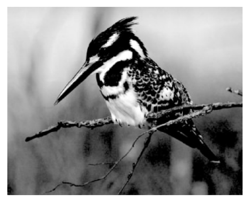
Come near to God and He will come near to you James 4:8

I know that God seems far, far off to many folks today, And even when they say a prayer He still seems far away. It could be that the trouble is they seldom keep in touch--I wonder if the reason is they don't love Him too much. Or they could be too busy with the things they have to do And only in emergencies would hope their "call" got through. They have not learned the secret yet that God is on their side, And cares what happens every day and wants to be their Guide If they'd just trust their lives to Him and talk to Him a lot, They'd find they'd have more peace of mind-more than they ever thought.