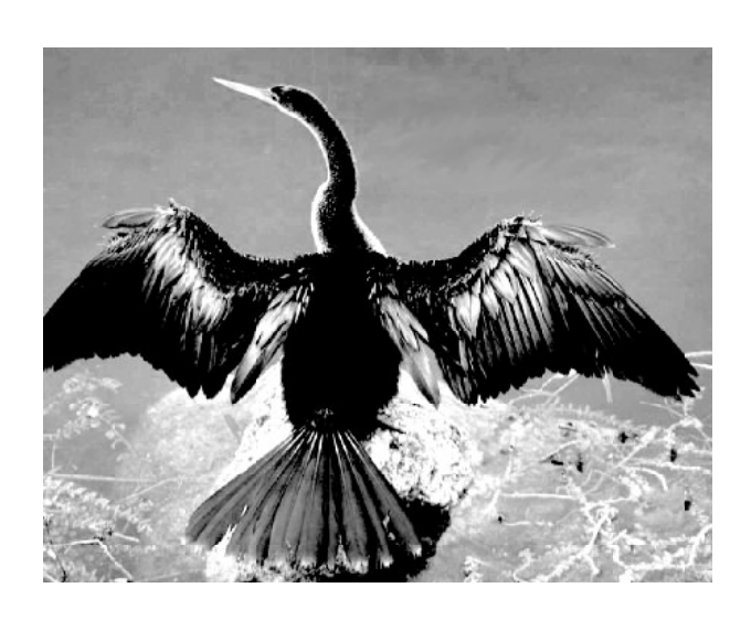
He determines the number of stars and calls them each by name. Psalms 147:4

But like the stars He's still up there observing things down here, So I'll enjoy the world He made and let it bring me cheer. I'm glad that God is in control though He is out of sight, And with that knowledge in my heart I'll go to sleep tonight.