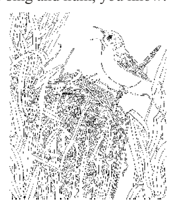
The Birds of the air nest by the waters; they sing among the branches. Psalms 4:12

Now that Christmas time is over and the tree is put away Along with lights and manger scenes for use another day, It seems folks are more thoughtful when the holidays are here And how we wish that peace on earth would last throughout the year. And though we hope the New Year will be better than the last It's easy to just settle in like in the days now past. Too many people don't slow down enough to just relax--The folks who always push and shove don't live life to the max. When angels come and give their nod and say "It's time to go" We hope that folks have taken time to sing and hum, you know.