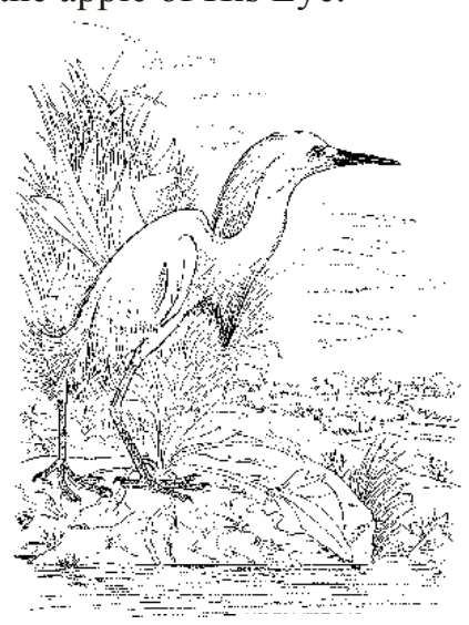
My help comes from the Lord, the maker of heaven and earth. Psalm 121:2

My heart will make a joyful noise unto my God and King, When I count up my blessings, folks, how can I help but sing? I'm in His care around the clock, He doesn't doze or sleep, And I can know within my heart my soul He'll always keep. So sing my heart; give forth a song; don't worry and don't sigh; Remember, friend, God says you are the apple of His Eye.