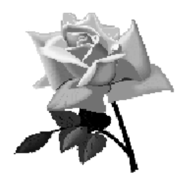
Genesis; chapter 1

And so He created all things everywhere And put them together so each one could share The love of each other, have plenty to eat And get along well with whatever they'd meet. Yes, God in six days made the earth at it's best And used the next day for enjoyment and rest.