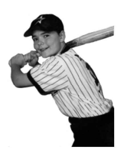
But encourage one another daily Hebrews 8:13

Encourage everyone you meet— your kids, your boss, your spouse And it may change the way you live at work or in your house. It never is too late to start to join the cheering crew And you will be amazed and pleased at what it does for you.