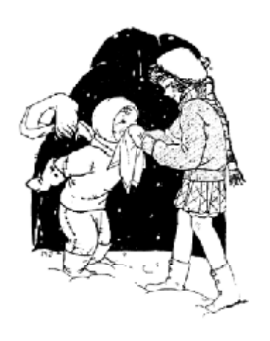
Therefore as God's chosen people... clothe yourself with compassion and kindness Colossians 3:12

So if you're on the winning team remember some are not And lend a hand to hurting folks who need the love you've got. So serve the Lord with all your heart, it's there that you will find Your life will be much happier and you'll have peace of mind.